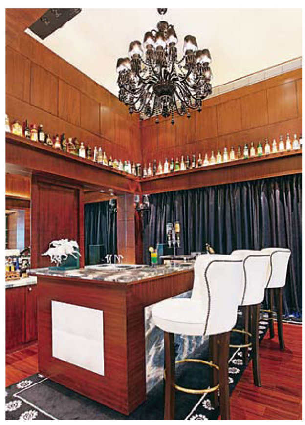
The bar with a display of Jimmy's collection of malts and vodkas

Jimmy's love for beautiful art and elegance flows through the residence. He enjoys having friends and visitors over and entertaining