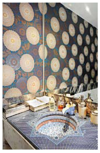
The powder room designed in blue tones reminiscent of the blue-tile work of Persia.

A grand self-playing piano at the far end of the living room, porcelain figurines from Lladro, the dining table always immaculately set with a customised white linen tablecloth, black crystal chandeliers and a painting by artist Gadnis speak of his eye for art and for fine living. A large red dragon takes pride of place on a shelf. Jimmy's love for animals shines in equine collectibles from a sparkling crystal horse to a statuesque black horse lamp and sphinx figurines. The two powder rooms on the floor are aesthetically designed. One is designed in blue tones: it has beautiful blue tiles on the counter and sunken sink, the