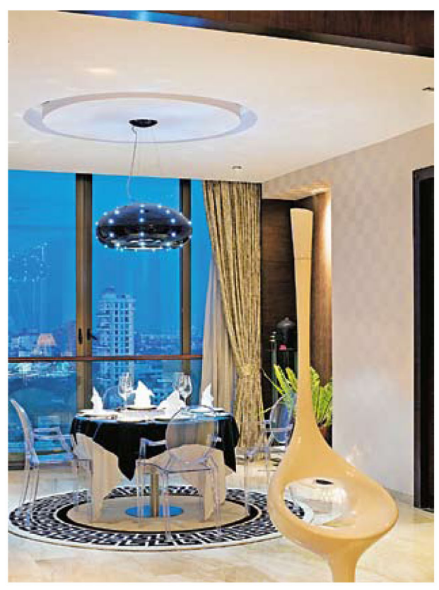
The breakfast table for the family with chairs designed by French designer Philippe Starck for Kartell and a Fabbian lamp overhead.

depictions such as the struggle between a bull and a lion that has multiple interpretations including signifying the cycle of life and of seasons.