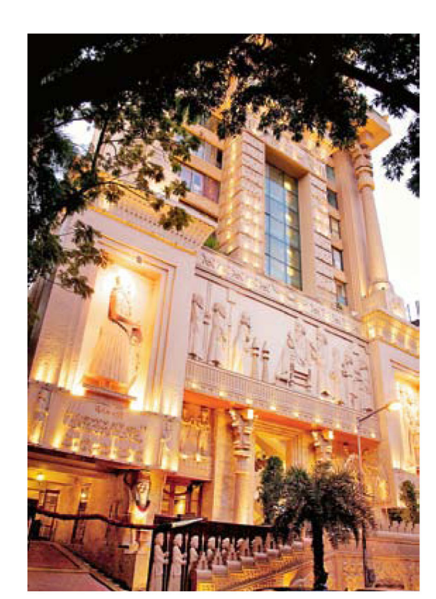
The façade of Della Tower, a 21-storey residential tower, at Parsi Colony, Dadar, Mumbai, offers a glimpse of the grandeur of Persepolis, the ceremonial capital of the ancient Achaemenid Empire in Iran, whose rulers practised the Zoroastrian faith, and whose descendants, the Parsis and Iranis settled in India.