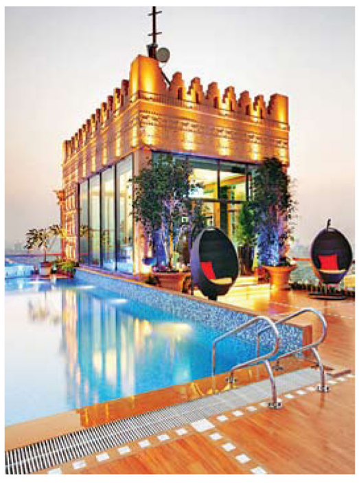
The open-to-sky pool on the top floor with a covered lounge area that blends traditional and modern elements in its design.

The twentyfour seater dining table is always immaculately set with a customised white linen tablecloth, fine crockery and cutlery.