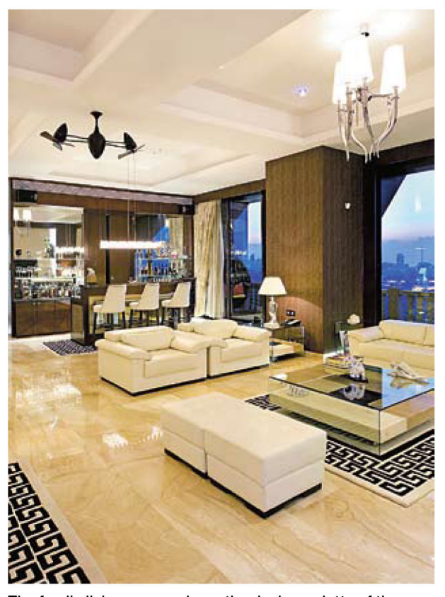
The family living room echoes the design palette of the formal living room in its colours and elements. A fan with chopper blades adds interest to the space.

The residence starts from the sixteenth floor that has a lobby, lounge, security, guest room, gym, salon and spa, office and library.