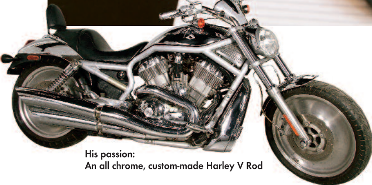
His passion: An all chrome, custom-made Harley V Rod