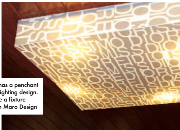
He has a penchant for lighting design. Here a fixture from Maro Design