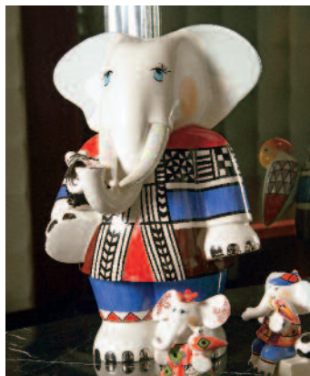
From Villeroy and Boch, these Ganeshas remind him of his family