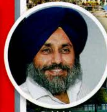
Sukhbir Singh Badal