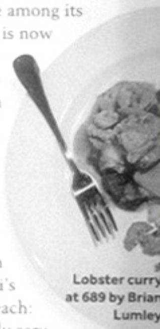
Lobster curry at 689 by Brian Lumley

The humble name belies its splendor: the Jamaica Inn opened in 1950 as a petite, well, inn. A honeymooning Marilyn Monroe and Arthur Miller were once among its guests, but the property is now a grand yet quite homey haven. Leave your bags at the front desk (check-in time is 3 p.m.) and collect your mallets. Yes, mallets. By the beach is a charming croquet lawn, perfect for a late-morning match. Follow it up with an afternoon swim in what's arguably Ochi's most immaculate beach: white sand, supernaturally cerulean waters and a backdrop of waves striking rugged cliffs.