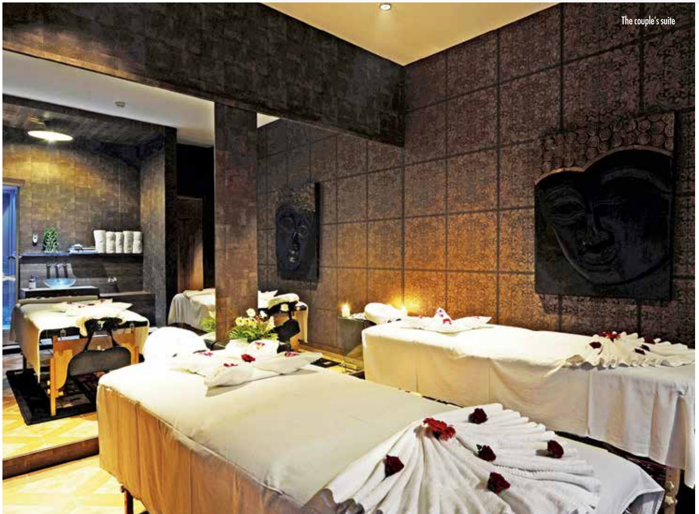
The couple's suite