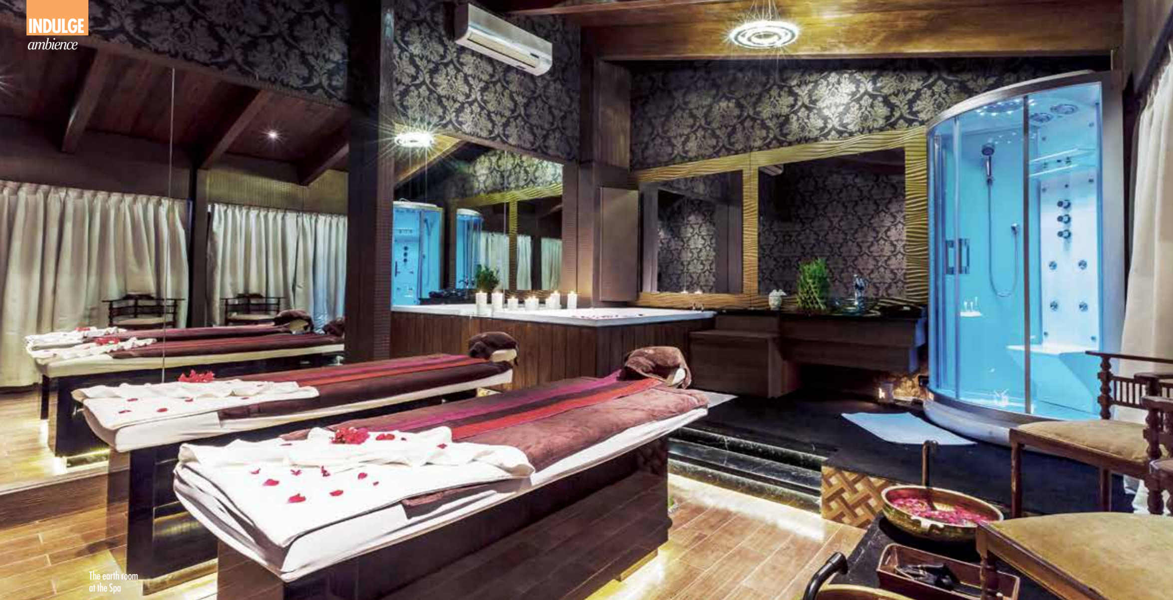
The earth room at the Spa