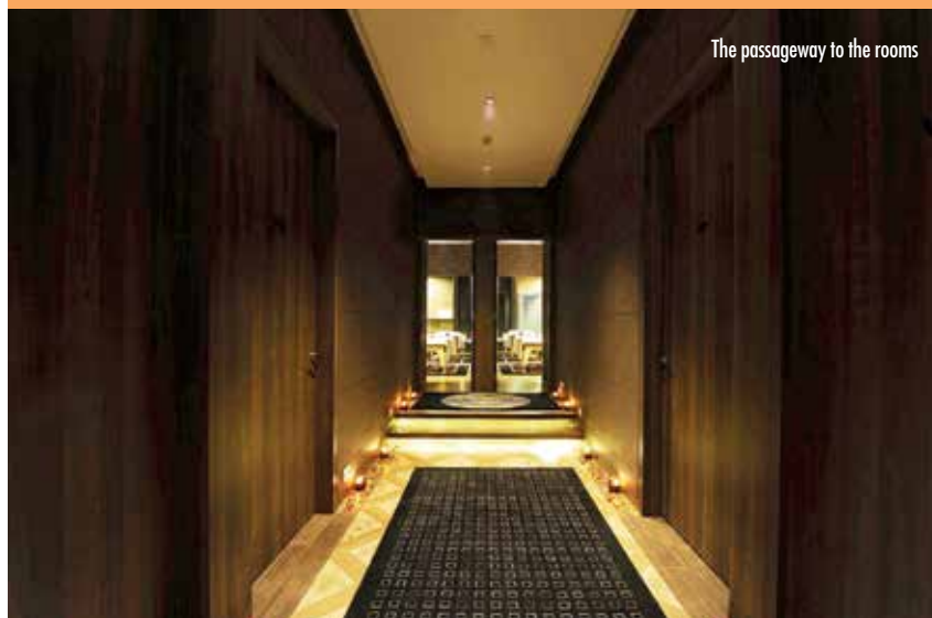
The passageway to the rooms

THEIR SIGNATURE 'ROYAL INDULGENCE' TREATMENT BEGINS WITH A SOOTHING MASSAGE, FOLLOWED BY A BODY SCRUB, AND IS TWO HOURS LONG.