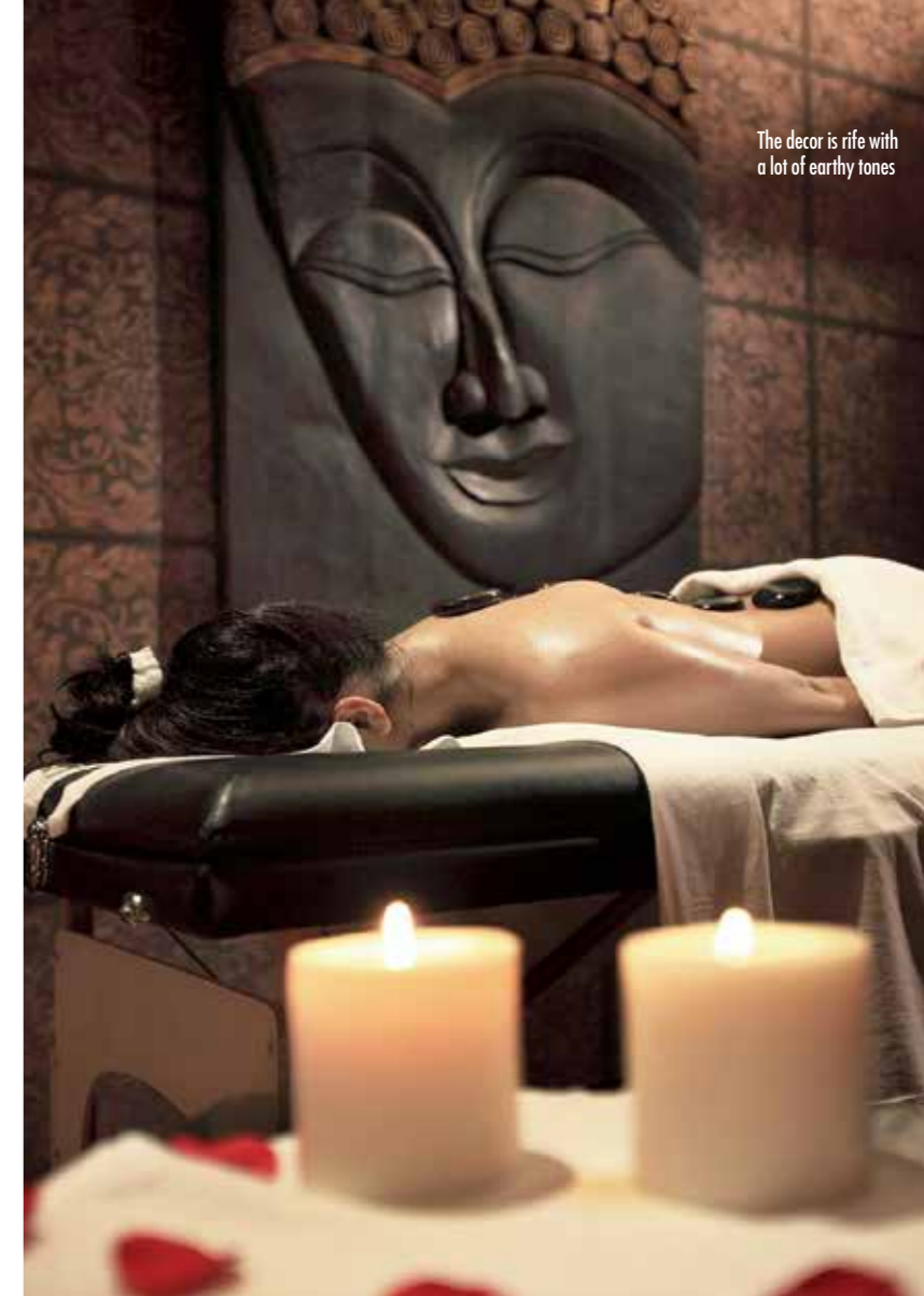
The decor is rife with a lot of earthy tones