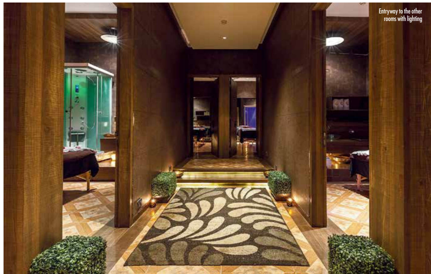
Entryway to the other rooms with lighting